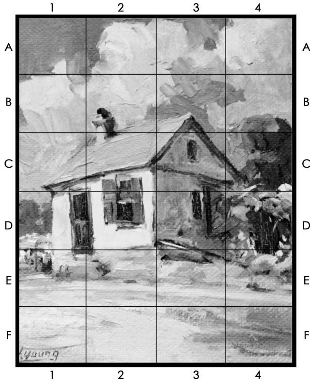
Black and white image of "Untitled (Red House)" by Florence Young. The original painting is in the Blanden Memorial Art Museum's Permanent Collection.

Now that you have practiced enlarging an image using simple lines from Level 1, we will expand our skill set and dive deeper into the Elements of Art and practice value and texture. You will recreate the image below in a 1:1 ratio using a pen or pencil. Begin by drawing the biggest objects or shapes first, and then add detail. Finally, copy texture and value.